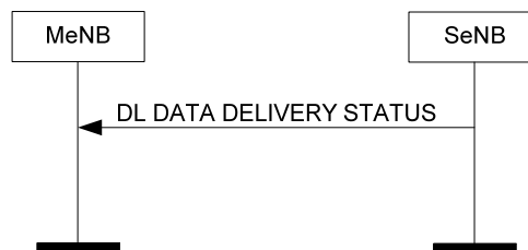
Figure 5.4.2.1-1: Successful Downlink Data Delivery Status

After being reported to the MeNB, the SeNB removes the respective PDCP sequence numbers.