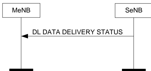
Figure 5.4.2.1-1: Successful Downlink Data Delivery Status

After being reported to the MeNB, the SeNB removes the respective PDCP sequence numbers.